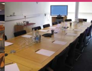
Innovation Centre Boardroom