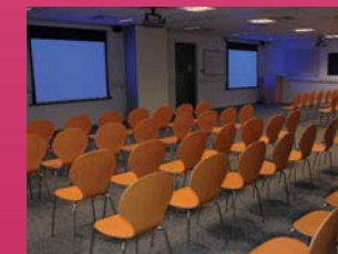
Cockcroft Walton Rooms

There are over 30 rooms available on Campus, a key selection of which is shown here. For the full list of additional meeting rooms, floor plans, dimensions and indicative prices, please contact us and we will be glad to arrange a package that perfectly matches your needs.