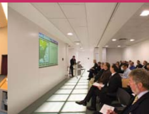
Innovation Centre Presentation Suite