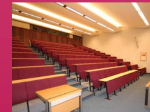
Merrison Lecture Theatre